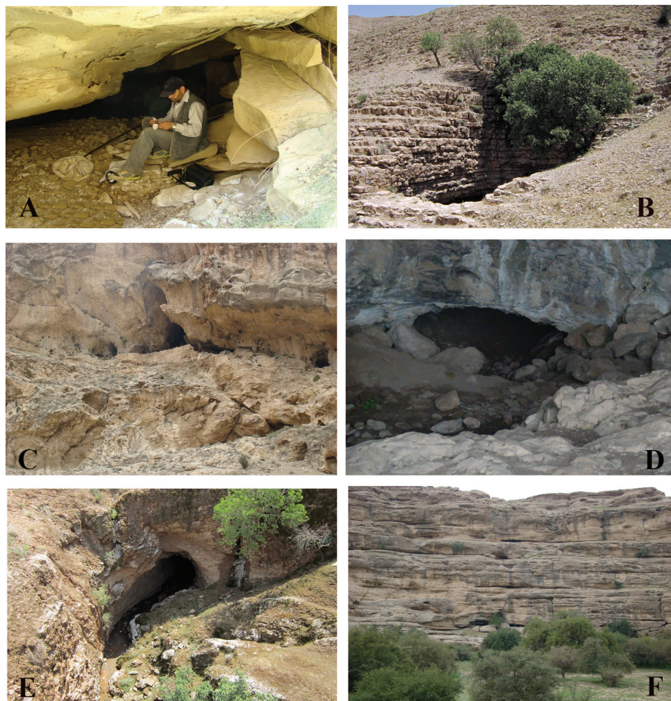
Figure 2. Some of the caves visited in the studied area. For more details and coordinations refer to Table 1. Dalaki (A), Taigh (B), Tadovan (C), Manian (D), Zarrinabad (E) and Gavbar (F).

Iran (Anderson 1999). Caves are not the common habitat for this gecko, but we could observe this species at two caves in Ilam and Fars provinces (Table 1). Darhamreh cave is limestone cave with a small and bright entrance. Internal environment of this cave is completely dry and there is no water. The other cave (Sangeshtkan) is a system of artificial underground spaces (disused sandstone mines) in a hill at the southern margin of Jahrom town (Fars province). The cave consists of some chambers with broken and fallen ceilings, creating a number of smaller spaces, fissures and crevices, well useful as roosts.