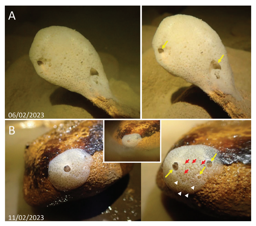
Figure 2. La Cueva de Los Sabinos pool 2, high magnification pictures, February 2023. Two specimens are shown ( A, B ). Arrows indicate water intake (red) and release (yellow) pores (osculum) as well as spicules (white). Dates of observation of the two specimens are indicated.

As of now, no sponge specimen has been observed in Los Sabinos pool 1. Yet, this pool needs to be further checked to confirm the absence of sponges. As mentioned above, the two pools are not connected during the dry season, but the two water bodies may join during exceptionally heavy rainy seasons. Interestingly, water parameters recorded in pool 1 and pool 2 were very different and may explain why the sponge is found only in the second pool (Table 1). The water temperature in the two pools differs by an average of 1.8 °C, with pool 2 always being warmer than pool 1 over the years. The minimum difference between the two pools was 1.6 °C, and the maximum difference was 2.2 °C. The dissolved oxygen concentrations were also repeatedly higher in pool 2 than in pool 1, in both February 2022 and February 2023. Studies have shown that water quality influences the distribution of sponge species (Evans 2016). Thus, the Los Sabinos sponge may have a temperature preference and/or oxygen preference that restricts its presence to pool 2, but further exploration is needed to support this preference.