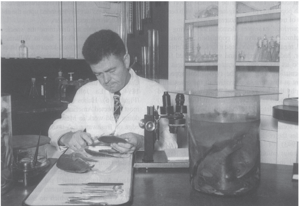
Figure 1. Carl Leavitt Hubbs in his laboratory at the Scripps Institution of Oceanography. This picture was taken in 1945, shortly after he had made his major contributions to hypogean fish research (Photograph courtesy of the Scripps Institution of Oceanography Library).

As primary sources, we examined all the records kept at UCSD. We selected and ordered copies of all that relate directly to biospeleology, totaling 668 documents. We paid particular attention to those dealing with blind fishes described by Hubbs. The selected documents were organized and analyzed according to the sender and the recipient(s), date on which they were written, and the kind of document (letters, cards, handwritten notes, telegrams, newspaper clippings). We also reviewed all Hubbs' original publications on this matter. Museum collection specimen accession data and