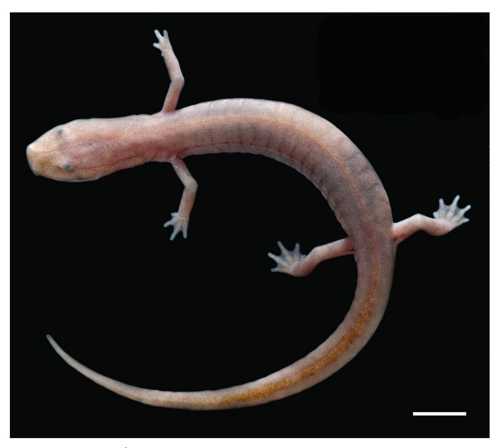
Figure 1. Eurycea spelaea showing troglobitic characters, lack of pigmentation and microphthalmy. Scale bar: 0.5 cm.

search. We collected 46 specimens of Eurycea spelaea from January-Stansbury Cave located in the Ozark Plateau National Wildlife Refuge in Delaware County, Oklahoma. Salamanders were housed individually in mesocosms submerged in the cave stream. Each mesocosm consisted of a 500 ml plastic bottle with small holes so that the salamanders had continuous access to fresh cave water. All lids were connected to a central line via a short string. Salamanders were collected June 6th but the study did not until June 22<sup>nd</sup>, salamanders were fed amphipods until the start of the study. During the study, salamanders were fed every four days either a strict diet of live amphipods, bat guano, or nothing. We collected amphipods and bat guano fresh on the day of feeding from the cave. The cave is inhabited by a maternity colony (ca. 15,000 individuals) of federally endangered Gray bats ( Myotis grisescens A.H. Howell, 1909) from late April through early November (Fenolio et al. 2006, 2014). Salamanders were randomly assigned to a negative control group, or one of two prey types and one of four feeding treatments based on percentage of initial body mass: 0% (control) 2.5%, 5%, and 10%. Salamanders were massed before feeding to track body mass loss or gain and fed