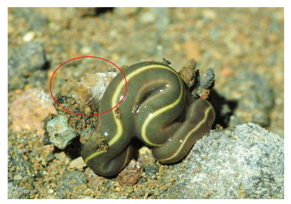
Figure 2. Individual of C. coerulea preying on an isopod (red circle).

to disperse through the soil pores. It is likely that the uppermost caves are more prone to invasion by C. coerulea than those having a greater depth of soil overlying them. The presence of C. coerulea in the mine was restricted to an area of high humidity and levels of oxygen and carbon dioxide similar to the surface, whereas in the branch with foul air it was never detected. This indicates that incursion by C. coerulea may be mediated by the subterranean atmospheric conditions, and that regions most similar to ambient surface conditions have a higher risk of invasion. The presence of roots may also play a role in the distribution of C. coerulea because the diversity and abundance of rhizophagous potential prey is correlated with the presence of roots in the mine. Mateos et al. (2013) described that during the attack of C. coerulea , it stands next to its prey and disposes of its pharynx to feed on it. However, in the case here reported the individual was wrapping the woodlouse while it was consuming it.